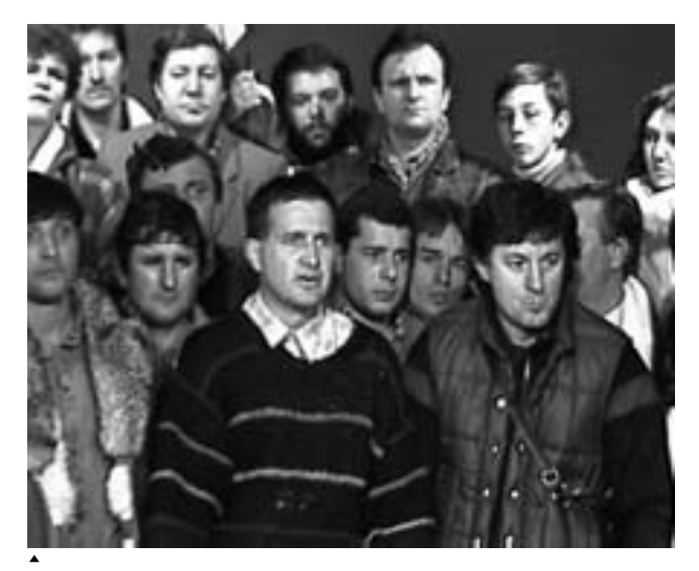
Harun Farocki and Andrei Ujica, Videograms of a Revolution , 1993.