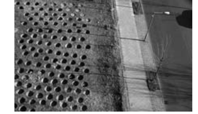
Kilian Rüthemann, Stripping , 2008. Installation view of the 5th Berlin Biennial for Contemporary Art at Skulpturenpark Berlin Zentrum. 300 pits, diameter each 80 cm.

Paola Pivi, If you like it, thank you. If you don't like it, I am sorry. Enjoy anyway, 2007. Installation view of the 5th Berlin Biennial for Contemporary Art at Neue Nationalgalerie. Aluminium, fiberglass, rhinestones.