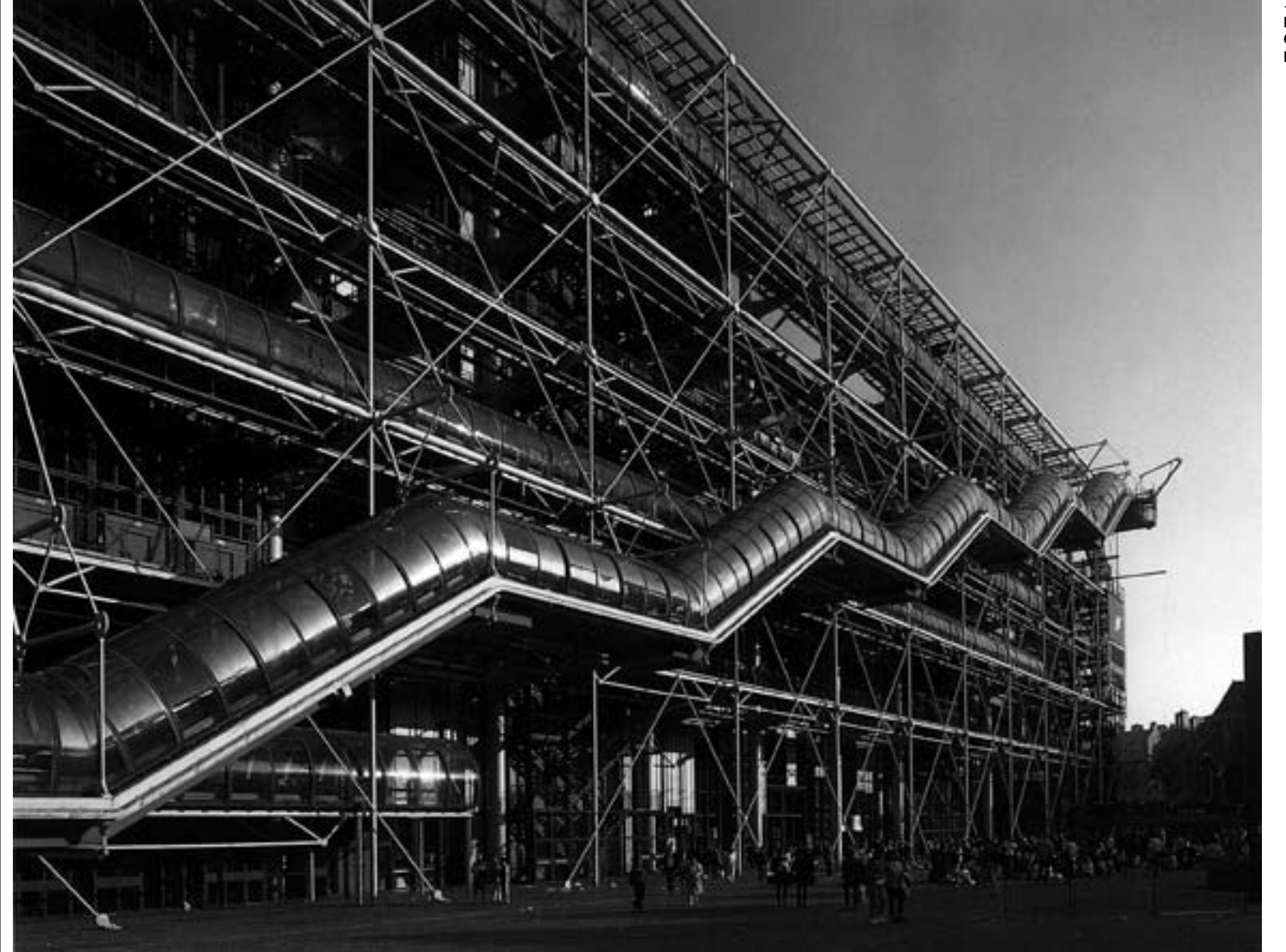
Renzo Piano and Richard Rogers Centre Pompidou, Paris, 1971–1977