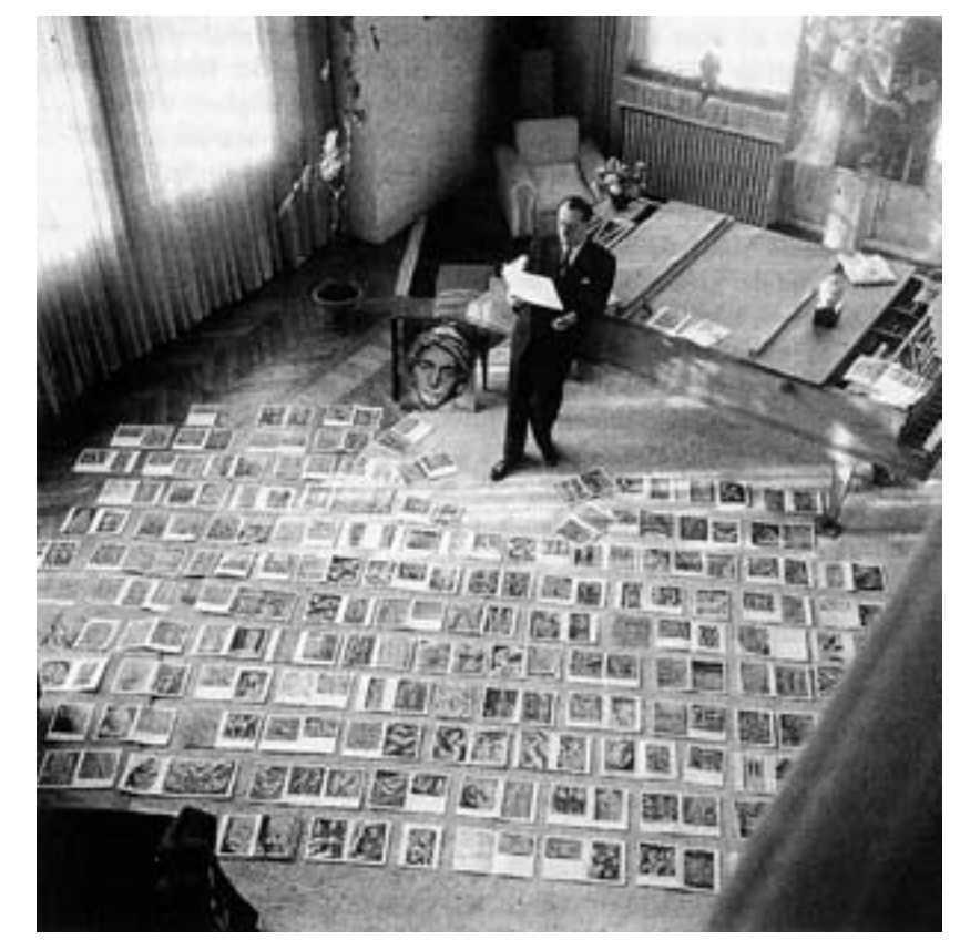
André Malraux in front of images for Le Musée imaginaire, ca. 1950

to consume culture rather than to reflect on it. However, the Pompidou is an example of the changing of a museum's identity through architecture and creating an exhibition and museum typology that, rather than being geared towards representation and representative spaces, intends to resemble a laboratory directed towards experimentation.