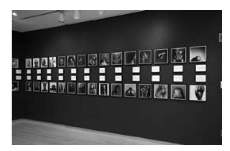
Glenn Ligon, Notes on the Margin of the Black Book, 1991–1993.